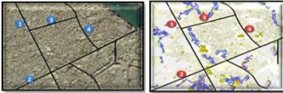
Figure (1): Form shows the streets of the old city of Mosul selected for study

Through field visit realism and observations show that the road network within the city suffers a lot of problems, which cause some confusions and problems in traffic, especially in the city where the crowded and traffic in the rush hours of morning and afternoon, and most of these central problems are: